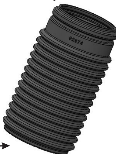
Poly dust cover

Note - the dust cover may be trimmed if required OR simply not used if application doesn't permit.