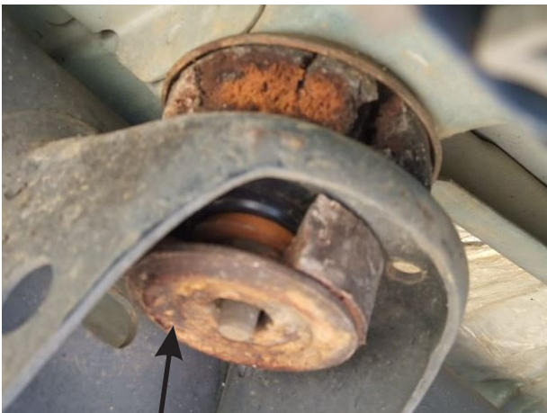
Re-use OE steel washers