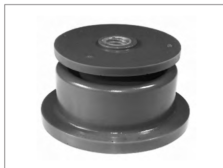
Thin Pad - on top

V6 VQ – VT Commodore fit the THIN PAD V8 VQ – VT Commodore fit the THICK PAD V6 & V8 VX – VZ Commodore fit the THICK PAD All model Monaros fit the THICK PAD All model Pontiac GTO fit the THICK PAD