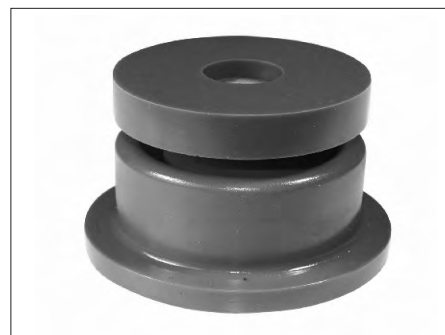
Thick Pad - on top