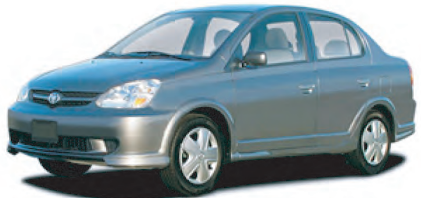
TOYOTA Echo (10/99-10/05)

As with most compact vehicles these days, vertically mounted rubber control arm rear bushings are a common wearing & service item. Nolathane has this covered with a standard replacement solution and offset option to rectify wheel alignment issues (caster) and counteract heavily cambered roads that typically causes the car to pull to the left on straight roads.