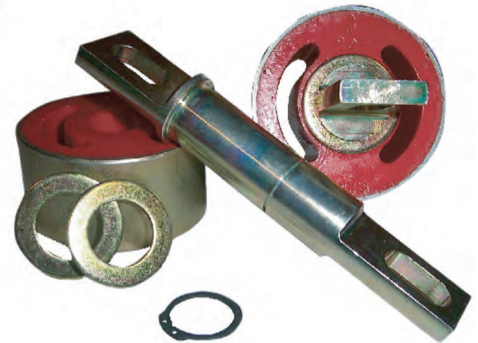
Pictured is 46179A which comes as a pair or you can buy them individually as part # 46179AS

Nolathane have now released single unit versions of its very popular trailing arm pivoting bushing for the wide range of Honda Civics, CR-V's, CRX and Concerto models. The units come complete with steel centre pin and feature bush voiding that deliver improved back end stability, handling predictability without compromising ride quality