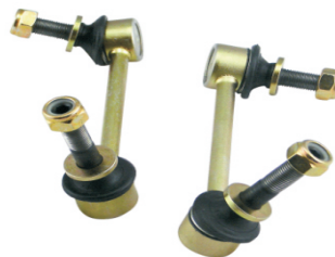
42719 Sway Bar Link - Front