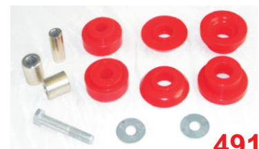
49174 Diff Mount

Designed to integrate and offer a fully balanced handling solution. Nolathane suspension offers replacement bushes and alignment products. So for a catalogue, brochure or technical information on any of the Nolathane products contact the Redranger team on 1300 88 2355 or visit www.nolathane.com.au