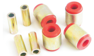
46229 Trailing Arm - Upper