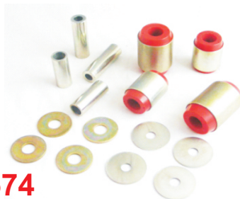
45574 Control Arm- Lower