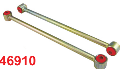
46910 Trailing Arm - Lower Complete