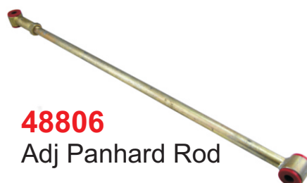
48806 Adj Panhard Rod