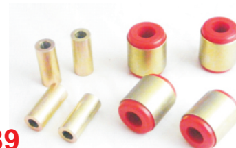
46289 Trailing Arm - Lower