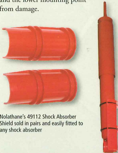
Nolathane's 49112 Shock Absorber Shield sold in pairs and easily fitted to any shock absorber

Manufactured from Nolathane, these shock shields protect your shock absorbers and their mountings from damage, shot peening, pitting, and sand blasting from the rocks and sand thrown up by the vehicles tyres. Designed primarily for 4WD vehicles travelling on dirt roads, outback tracks and sand dunes, but can be easily fitted to any vehicle or shock absorber that requires protection. These universal shock shields are attached to the lower body of the shock absorber to cover and protect the body and the lower mounting point from damage.