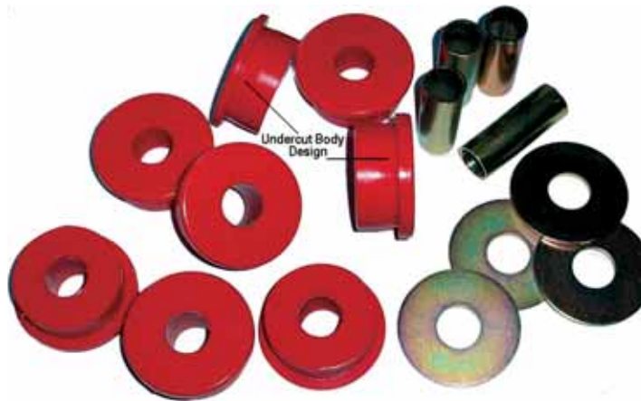
A typical Nolathane kit with washers and undercut bush body design.)

For a product update sheet or more information contact the Redranger Team on the numbers in the "COMPANY AT A GLANCE" box or go to the www.nolathane.com.au web site.