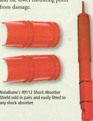
Nolathane's 49112 Shock Absorber Shield sold in pairs and easily fitted to any shock absorber

Manufactured from Nolathane, these shock shields protect your shock absorbers and their mountings from damage, shot peening, pitting, and sand blasting from the rocks and sand thrown up by the vehicles tyres. Designed primarily for 4WD vehicles travelling on dirt roads, outback tracks and sand dunes, but can be easily fitted to any vehicle or shock absorber that requires protection. These universal shock shields are attached to the lower body of the shock absorber to cover and protect the body and the lower mounting point from damage.